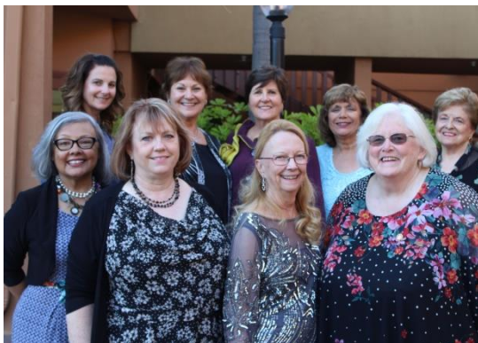
Our newly installed 2019-2021 District Officers